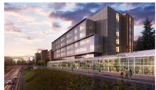
Life Science Complex rendering by architects Perkins+Will