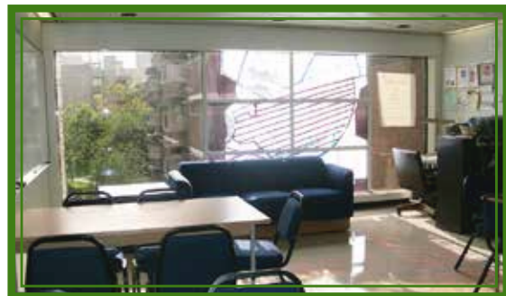
Fourth floor lounge in Hitchcock