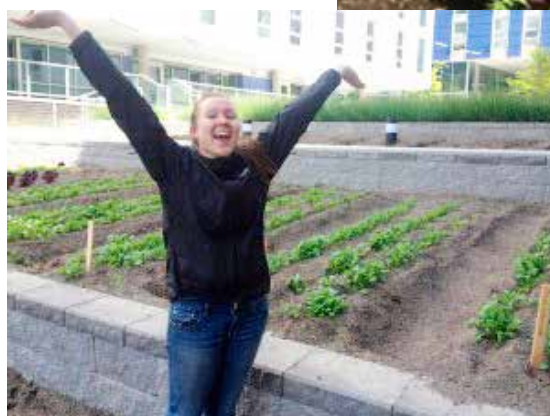
Garden down by the Mercer Court.