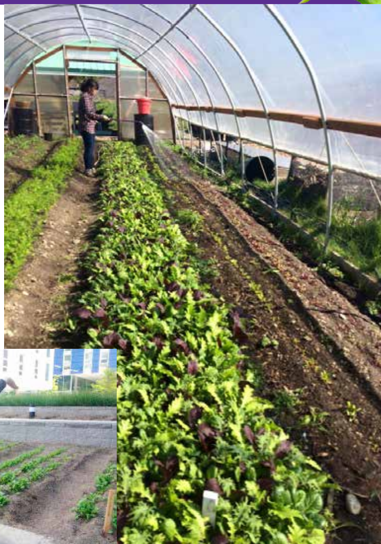
Garden down by the Center for Urban Horticulture.