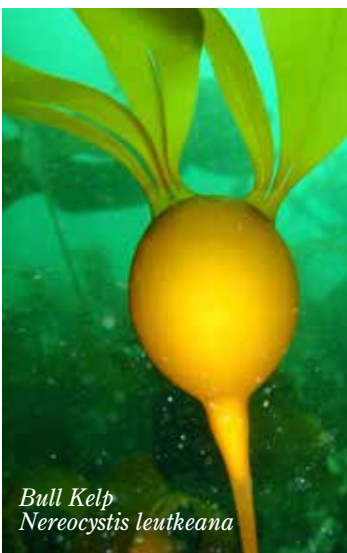
Bull Kelp Nereocystis leutkeana