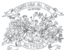
2015 T-shirt Winner