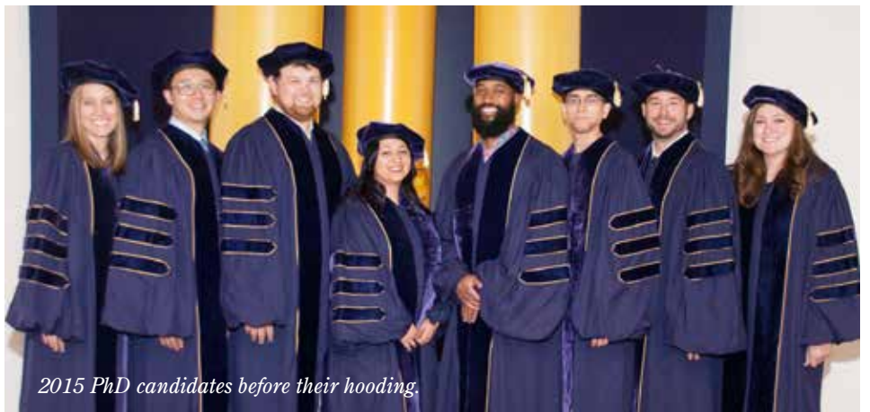
2015 PhD candidates before their hooding.

No tickets are required but ALL STUDENTS are required to RSVP by June 6 by completing the Biology Graduation Celebration catalyst form at: https://catalyst.uw.edu/webq/survey/jgt3/296638 . This RSVP is an additional requirement if you are participating in the departmental celebration. Then we will know you are attending AND you will get a name pronouncing card at check-in.