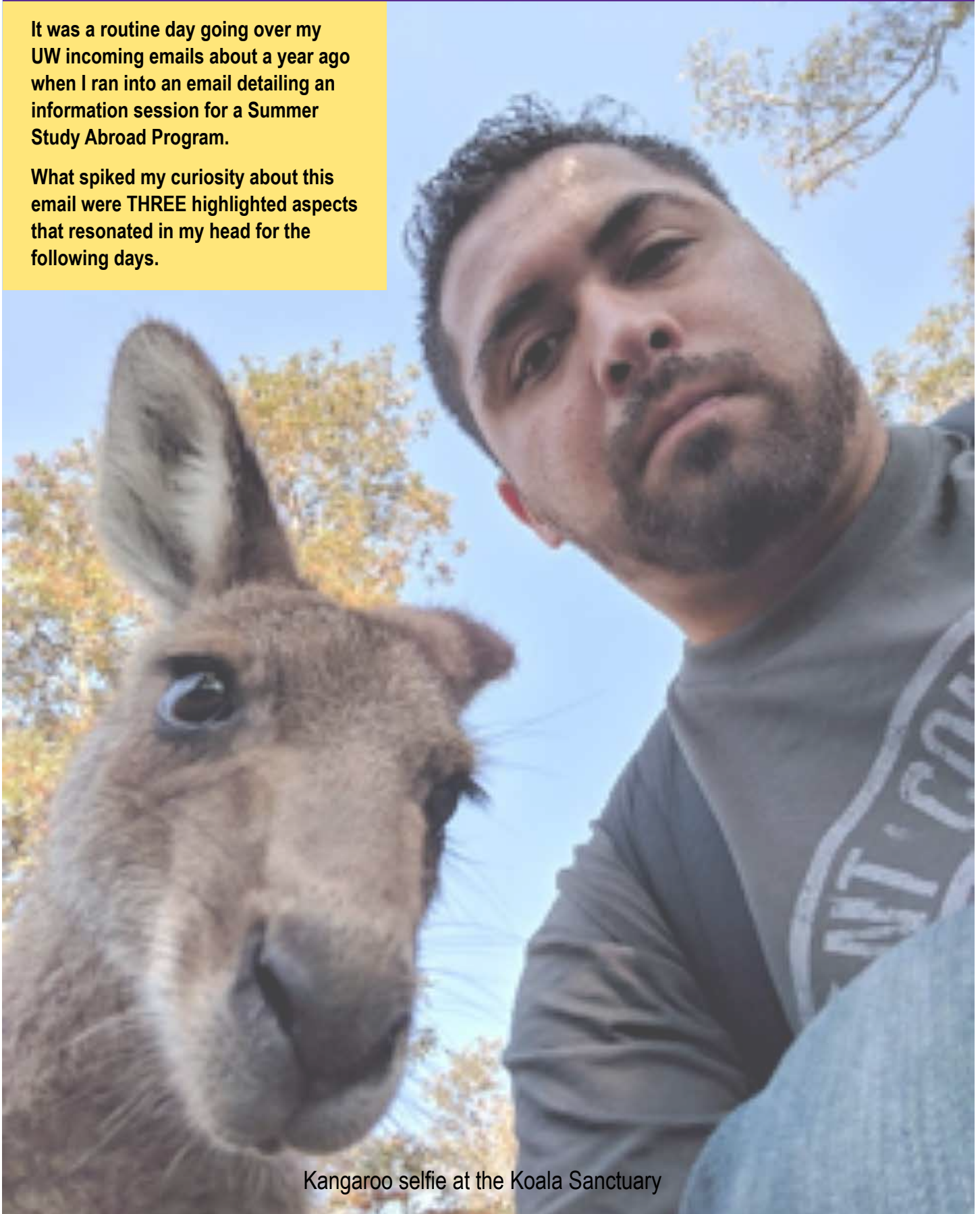
Kangaroo selfie at the Koala Sanctuary

What spiked my curiosity about this email were THREE highlighted aspects that resonated in my head for the following days.