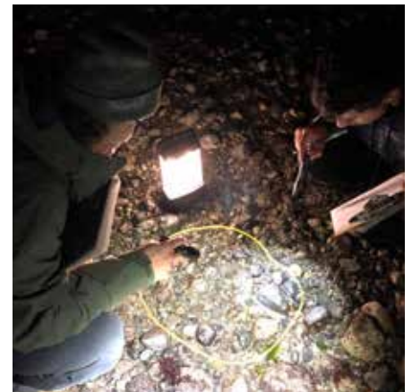
One of the exercises that we did was throw a rope onto the ocean ground and then count the different species that were in that one circle. You can identify what type of lifestyle, including food and predators that occupy a particular region just by observing a couple organisms.

"I learned that the shores of the Puget Sound on low tide are far more diverse than I could have ever imagined. Not only are there innumerable different species of organisms on the shores, but they all lead unique and diverse lives and play important roles in the ecosystem."