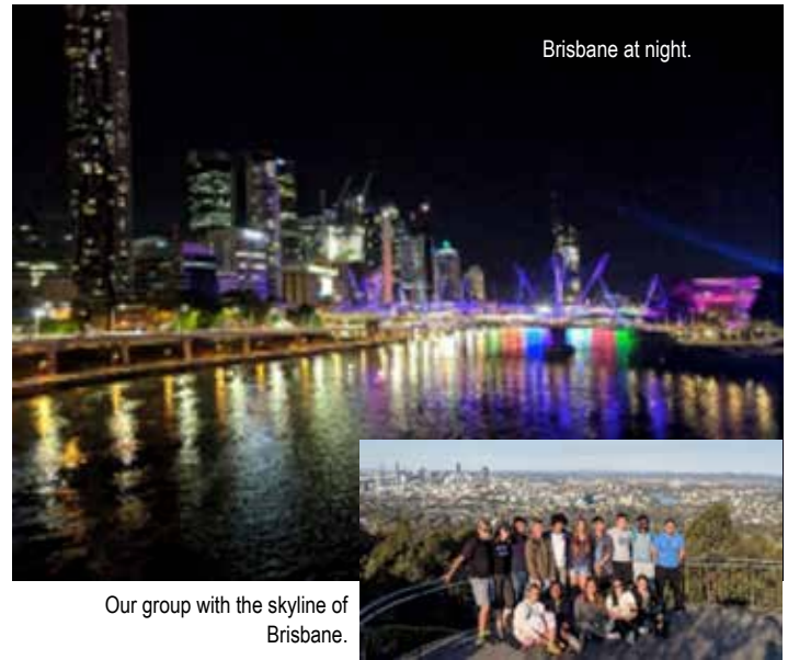
Our group with the skyline of Brisbane.