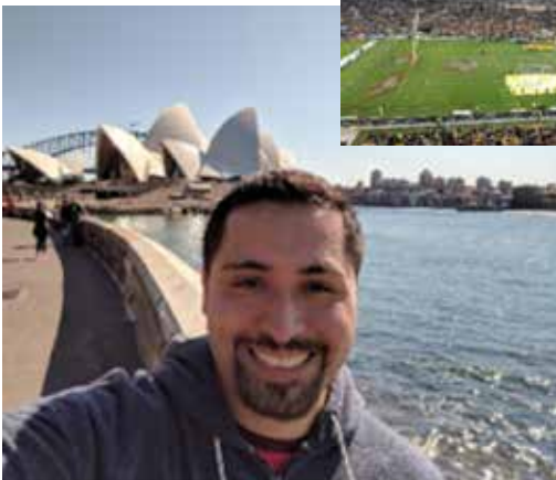
The Opera House in Sidney.