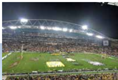
Rugby game AU vs NZ. Before the Haka performance by the NZ Team.