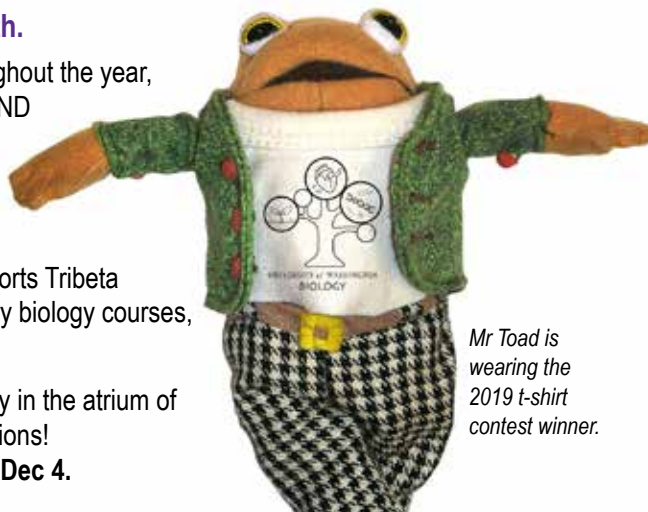
Mr Toad is wearing the 2019 t-shirt contest winner.

Biology Apparel Wednesdays in Autumn Quarter are Oct 2, Nov 6, and Dec 4.