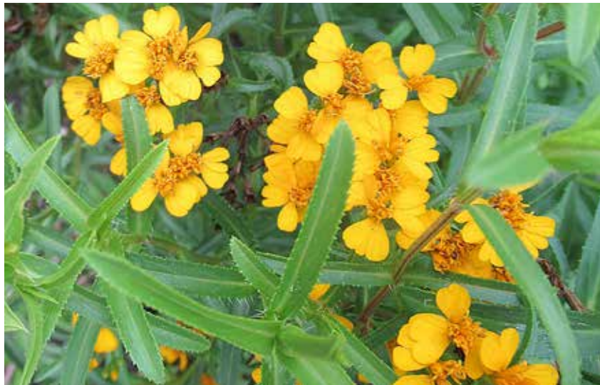
This mystery plant is currently blooming in the Medicinal Herb Garden.