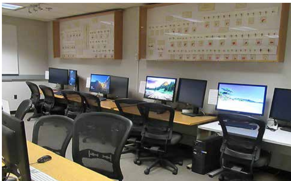
On this wall of the BSA is a display of Odonata of Washington state.

On three walls of the BSA are wonderful collection displays to look at and learn.